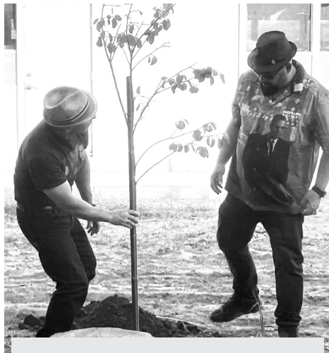
Planting a tree for Malcolm X at the Free AME Freedom Garden.