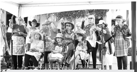
The wonderful Raging Grannies sing at Earth Day Fresno.