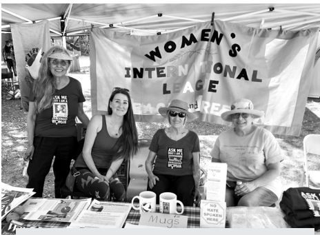
The WILPF Booth on Earth Day.