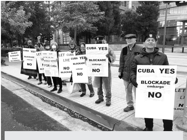
UN vote demo.

Predictions: 1) Brazil, with newly elected President Ignacio da Silva, will oppose the blockade next year (see the article on Brazil in this issue of the Community Alliance newspaper). 2) The United States will continue to defy essentially unanimous world opinion and continue this illegal and immoral blockade.