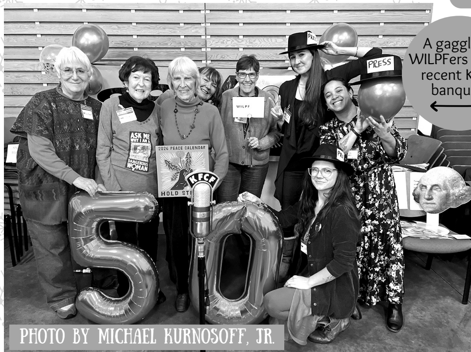
A gaggle of WILPFers at the recent KFCF banquet.

Send dues to: WILPF Fresno P.O. Box 5114 Fresno, CA 93755