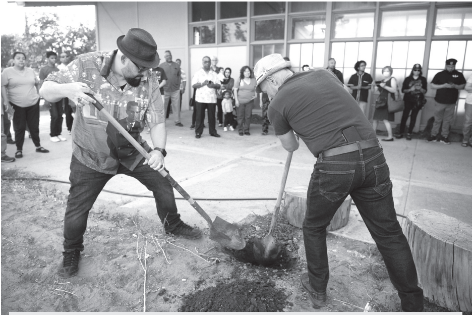
Planting a tree to commemorate the birthday of Malcolm X.

In his spirit, we recognize and express our solidarity with the heroic struggle of the Palestinian people against the Israeli attempt to exterminate them and to rip away the shreds of their homeland that still remain.