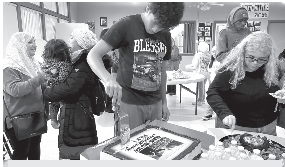
Reclaiming the Revolutionary Martin Luther King cake, Jan. 15, 2024