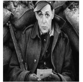
Sir Paul McCartney from his video "Pipes of Peace" from the album Pipes of Peace. (1983)

I ran across a headline that blamed Germany for World War 1 and thought that if it takes two to tango, four to play bridge and seven for an orgy then all the countries that had participated should share some responsibility for the devastation except, because of the war, became new and had to start with a mess they had inherited by the former leaders. Yet most people blamed Germany as the losers despite the demise of Ottoman Empire that came tumbling down but no one seems to care. The Soviet Union, due to its Socialist Revolution and leaving the war prematurely received the worst incrimination from both Allied and Axis powers. Immediately at the end of the War, both winners and losers of the war joined together to attack the newly formed Soviet Union. Even the last Premier of Russia, before the Bolshevik Revolution, Alexander Kerensky, and the Czars Secret Police; the Cossacks, joined and helped began the Russian Civil War which lasted until the Soviet Union sent the last American prisoner of war home in April of 1920. Oh well, war is so hard to please people unless you can take credit for the win even if you did not.