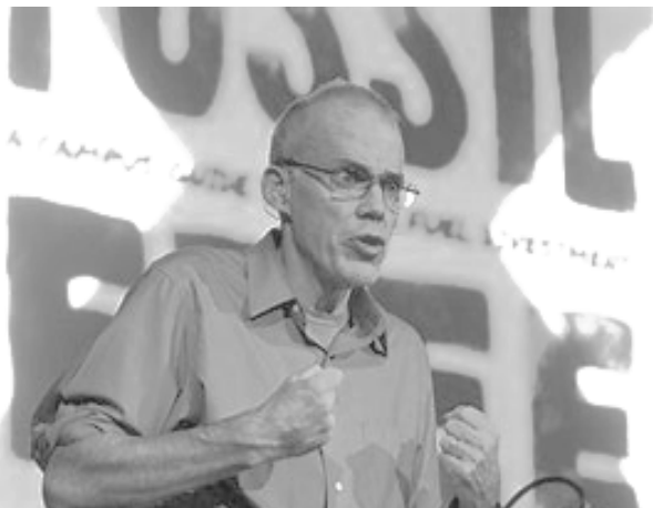
Environmentalist Bill McKibben to speak at the Unitarian Universalist Church in Fresno on the afternoon of Saturday, June 11 th .

Dedicated to PEACE and SOCIAL JUSTICE through SIMPLICITY ~ JUSTICE ~ INCLUSIVENESS ~ NON-INJURY 1584 N. Van Ness Ave., 93728 - www.centerfornonviolence.org - email: info@centerfornonviolence.org - (559)237-3223. Facebook: https://www.facebook.com/FresnoCenterforNonviolence/