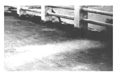
On August 6, 1945, during World War II (1939-45), an American B-29 bomber dropped the world's first deployed atomic bomb over the Japanese city of Hiroshima. The explosion wiped out 90 percent of the city and immediately killed 80,000 people; tens of thousands more would later die of radiation exposure. Pictured above are some of those who died and now their shadows remain.