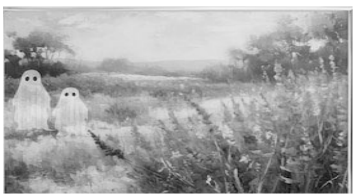
Every have one of those days oh, months...

Every have one of those months when your brain wants to take a break or just break down. But this is the beginning of the holiday season, you know Halloween to New Years. Happy, happy, buy and buy those saccharine and toxic laced candies for the kiddies. Buy and buy food for all the relatives to eat after laboring over the stove while they watch football on the tv, and then again buy and buy them all gifts for the sacredness of all holidays, Black Friday, and then Christmas as an afterthought. But of course, nothing ends a year out right than a final day of drunken bacchanalia. Chill out! Can't we just take it easy. Kick back and relax, DON'T BUY ANYTHING. Is giving a box of raisins for Halloween so bad or just a nice simple meal with those you really care about opposed to the whole ridiculous family?