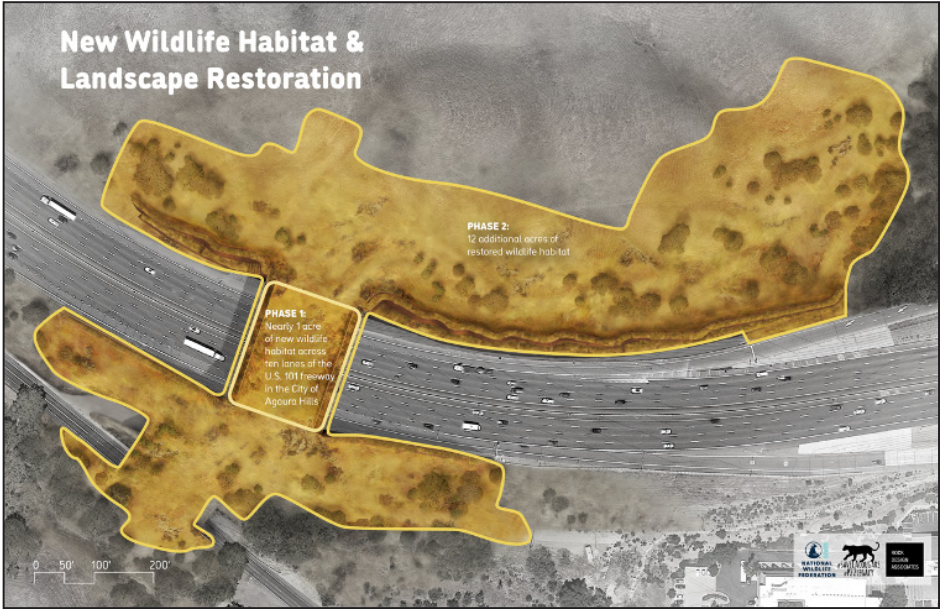
Wallis Annenberg Highway 101 Wildlife Crossing

The showpiece of this initiative is the Wallis Annenberg Wildlife Crossing . When opened, this $87 million project will be the world’s largest wildlife crossing , 165 feet wide by 200 feet long. connecting open space on both sides of Highway 101 in Agoura Hills (LA County).